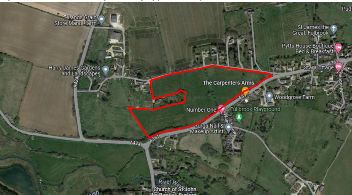
Figure 1: Site 1 Location (boundary approximate)