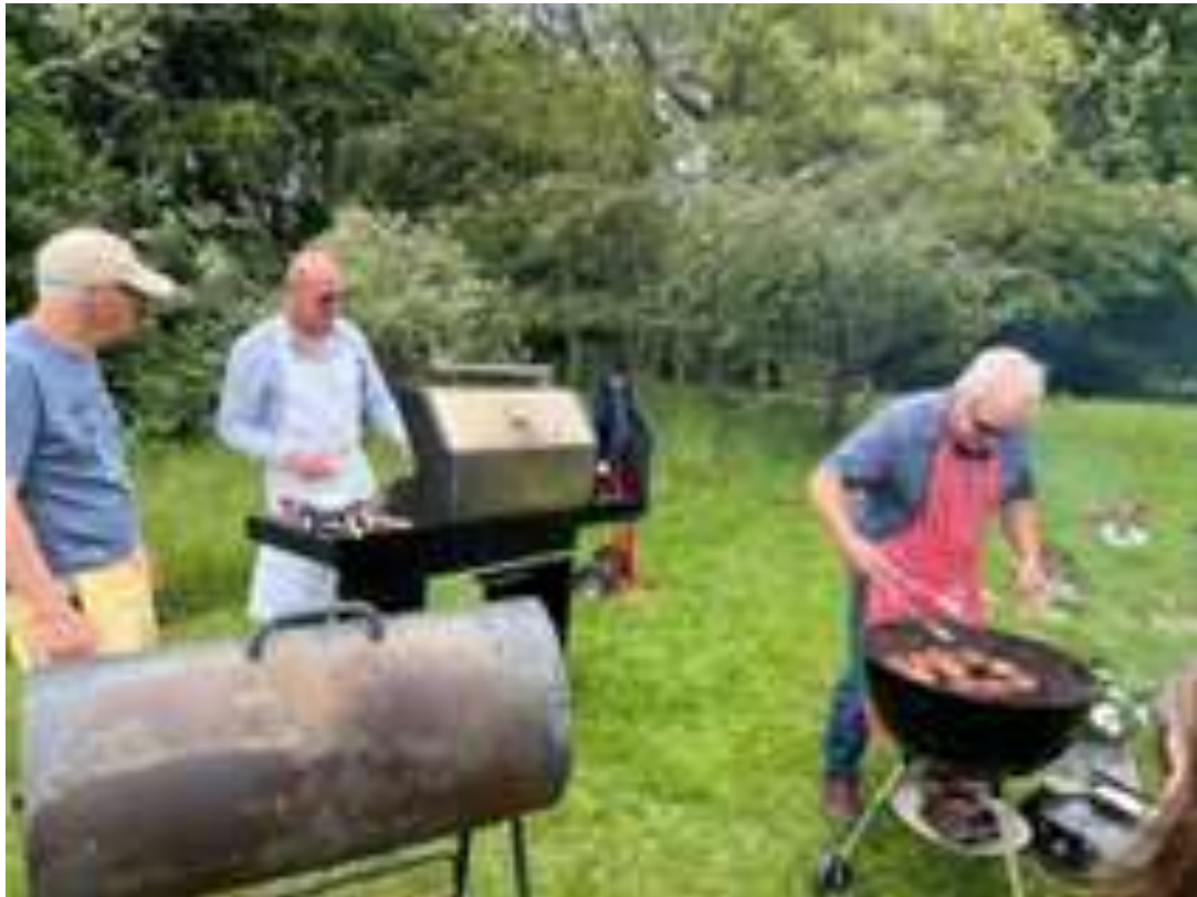
Photo of the very successful Village Barbecue held in the grounds of Fulbrook Church on 16 th July.

See Angela Weller's article on page 8 for further details